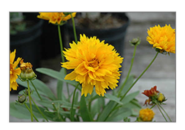
Sunray Tickseed flowers

Compact plant with double daisy-like yellow flowers; tolerant of pests and drier soils; thriving in sandy and rocky soils; compact habit is great for pots; coreopsis needs good drainage