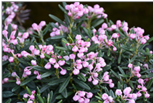
Blue Ice Bog Rosemary flowers