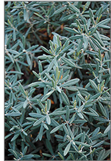
Blue Ice Bog Rosemary foliage

This shrub does best in full sun to partial shade. It prefers to grow in moist to wet soil, and will even tolerate some standing water. It is not particular as to soil type, but has a definite preference for acidic soils, and is subject to chlorosis (yellowing) of the foliage in alkaline soils. It is somewhat tolerant of urban pollution, and will benefit from being planted in a relatively sheltered location. Consider applying a thick mulch around the root zone in winter to protect it in exposed locations or colder microclimates. This is a selection of a native North American species.