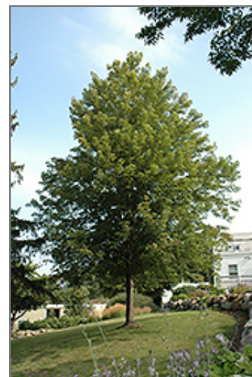
Celebration Maple