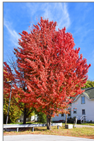
Celebration Maple in fall