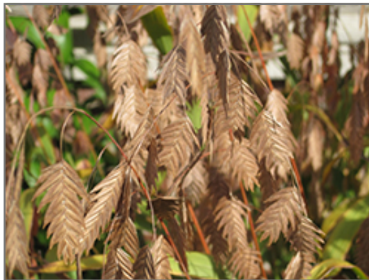
Northern Sea Oats fruit

Northern Sea Oats is a fine choice for the garden, but it is also a good selection for planting in outdoor pots and containers. Because of its height, it is often used as a 'thriller' in the 'spiller-thriller-filler' container combination; plant it near the center of the pot, surrounded by smaller plants and those that spill over the edges. It is even sizeable enough that it can be grown alone in a suitable container. Note that when growing plants in outdoor containers and baskets, they may require more frequent waterings than they would in the yard or garden.