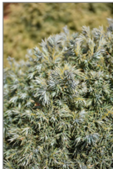
True Blue Dwarf Moss Falsecypress foliage

True Blue Dwarf Moss Falsecypress will grow to be about 24 inches tall at maturity, with a spread of 24 inches. It tends to fill out right to the ground and therefore doesn't necessarily require facer plants in front. It grows at a slow rate, and under ideal conditions can be expected to live for 60 years or more.