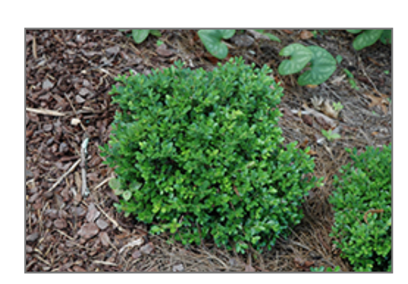
Morris Midget Boxwood

A compact shrub that's ideal for small and formal hedges, edging and topiary; slow growing