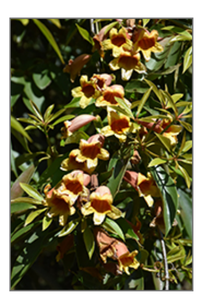
Cross Vine flowers

Cross Vine is recommended for the following landscape applications;