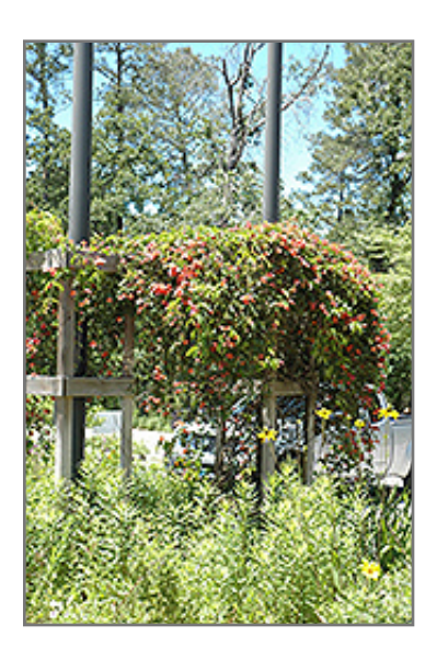
Cross Vine in bloom

This woody vine does best in full sun to partial shade. It is very adaptable to both dry and moist growing conditions, but will not tolerate any standing water. It is not particular as to soil type, but has a definite preference for acidic soils. It is highly tolerant of urban pollution and will even thrive in inner city environments. This species is native to parts of North America.