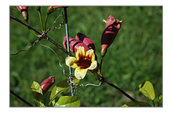
Cross Vine flowers