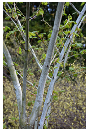
Joe Witt Snakebark Maple bark