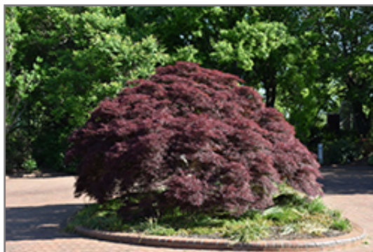
Purple-Leaf Threadleaf Japanese Maple

Purple-Leaf Threadleaf Japanese Maple is recommended for the following landscape applications;