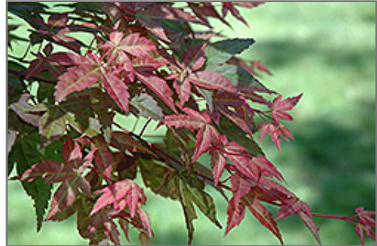
Monroe Vine Maple in spring

This shrub does best in partial shade to shade. It requires an evenly moist well-drained soil for optimal growth, but will die in standing water. It is not particular as to soil pH, but grows best in rich soils. It is somewhat tolerant of urban pollution, and will benefit from being planted in a relatively sheltered location. Consider applying a thick mulch around the root zone over the growing season to conserve soil moisture. This is a selection of a native North American species.