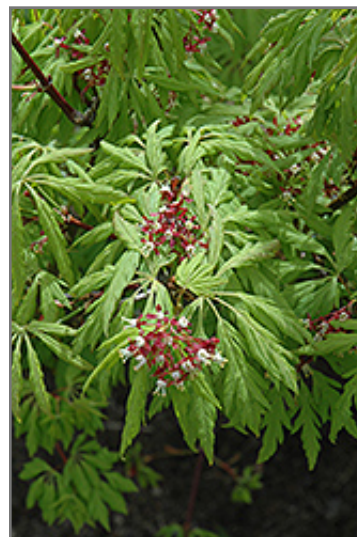
Monroe Vine Maple flowers