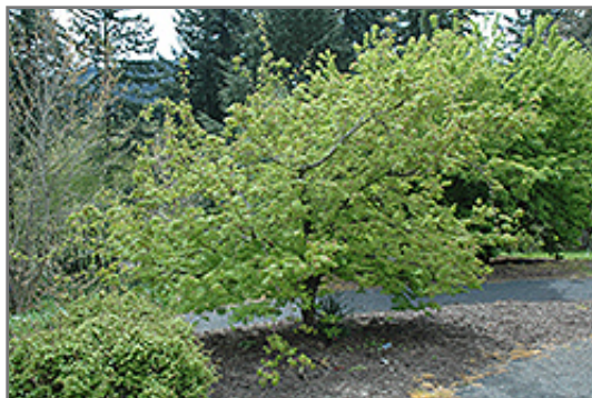
Monroe Vine Maple in bloom