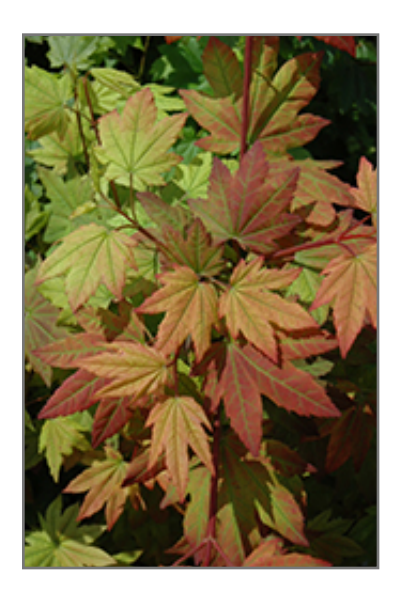
Vine Maple foliage

This is a relatively low maintenance shrub, and should only be pruned in summer after the leaves have fully developed, as it may 'bleed' sap if pruned in late winter or early spring. It has no significant negative characteristics.