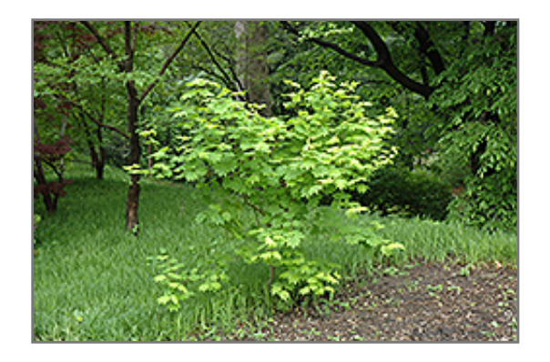
Vine Maple

Vine Maple is recommended for the following landscape applications;