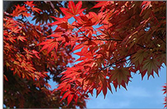
Oshio Beni Japanese Maple foliage

This tree does best in full sun to partial shade. You may want to keep it away from hot, dry locations that receive direct afternoon sun or which get reflected sunlight, such as against the south side of a white wall. It prefers to grow in average to moist conditions, and shouldn't be allowed to dry out. It is not particular as to soil pH, but grows best in rich soils. It is somewhat tolerant of urban pollution, and will benefit from being planted in a relatively sheltered location. Consider applying a thick mulch around the root zone in winter to protect it in exposed locations or colder microclimates. This is a selected variety of a species not originally from North America.