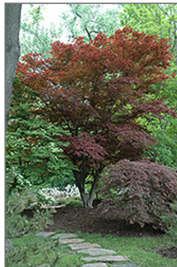
Oshio Beni Japanese Maple