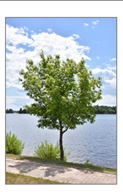
Baron Boxelder

This male selection is a dramatic improvement on the species with its uniformly rounded shape, does not produce prolific seeds like the species; a very durable shade tree for the toughest of locations and an all-round better choice