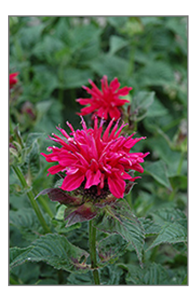
Fireball Beebalm flowers

A compact garden plant with fiery bright red flowers in summer, great for borders and containers, attracts hummingbirds; this variety exhibits greater mildew resistance than others of this species