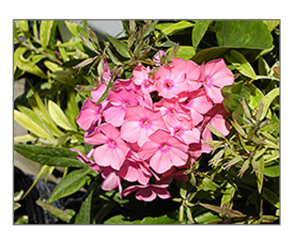
Bill Baker Phlox flowers

Thick lance-shaped leaves are adorn this North American native pholx discovered by Bill Baker; flowers are clustered in cymes in either pink or purplish tones depending on the soil conditions provided