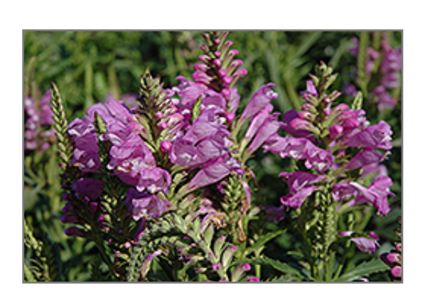
Vivid Obedient Plant flowers

A smaller more compact version of obedient plant with very pretty rosy-pink blooms; still a rather vigorous plant like the species, a fine selection where it can be contained