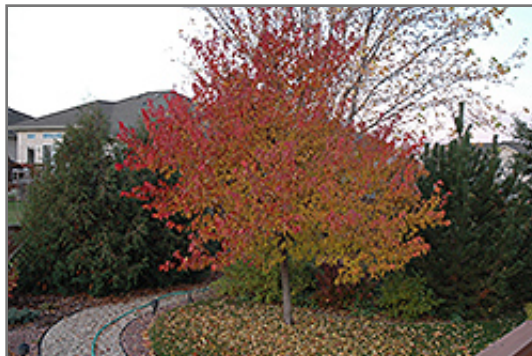
Embers Amur Maple in fall