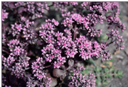
Red Carpet Stonecrop flowers