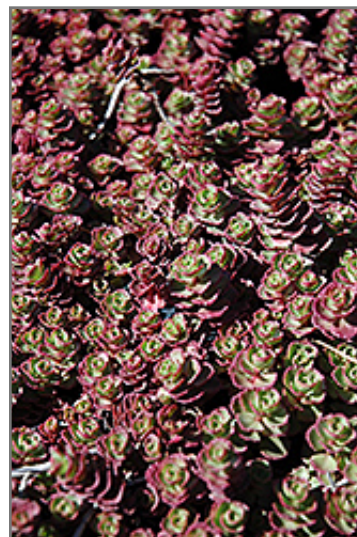
Red Carpet Stonecrop foliage