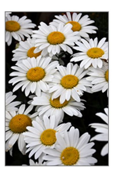
Snowcap Shasta Daisy flowers

A delightful variety of the ever-popular shasta daisy known for a high bloom rate; abundant beautiful white blooms with yellow eyes rise above and graciously contrast the deep green foliage; wonderful choice to mass as a garden focal point