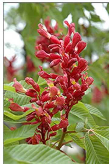
Red Buckeye flowers