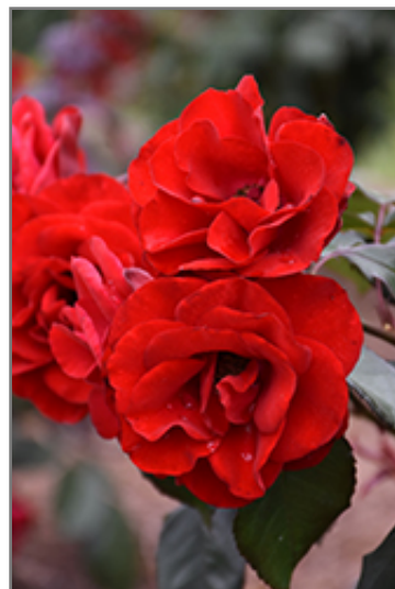
Europeana Rose flowers