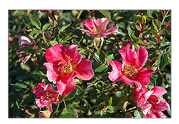
Happy Chappy Rose flowers

Attractive colourful groundcover rose perfect for borders; blooms appear in dark and light shades of pink and orange with yellow centers with five petals each; very disease resistant, remove dead blooms to encourage re-blooming