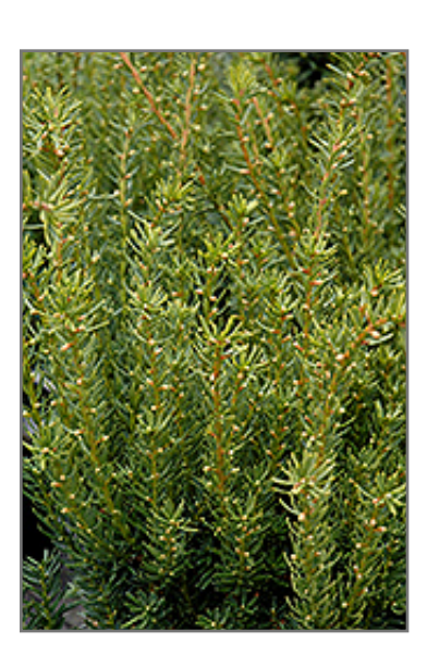
Fairview Yew foliage

Fairview Yew is a dwarf conifer which is primarily valued in the landscape or garden for its ornamental globe-shaped form. It has dark green evergreen foliage which emerges light green in spring. The ferny sprays of foliage remain dark green throughout the winter.