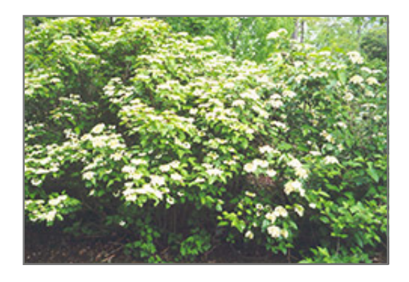
Sargent's Viburnum in bloom

Sargent's Viburnum is recommended for the following landscape applications;