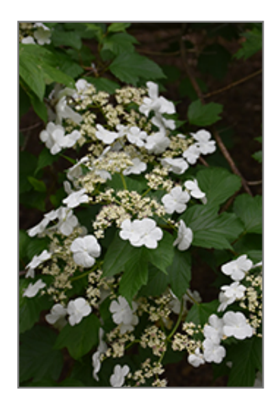
Sargent's Viburnum flowers

This is a relatively low maintenance shrub, and should only be pruned after flowering to avoid removing any of the current season's flowers. It is a good choice for attracting birds to your yard, but is not particularly attractive to deer who tend to leave it alone in favor of tastier treats. It has no significant negative characteristics.