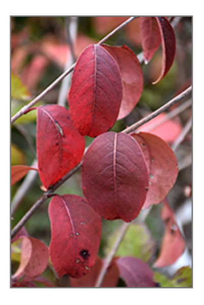
Blackhaw Viburnum in fall

This shrub does best in full sun to partial shade. It is very adaptable to both dry and moist locations, and should do just fine under average home landscape conditions. It is not particular as to soil type or pH. It is highly tolerant of urban pollution and will even thrive in inner city environments. This species is native to parts of North America.