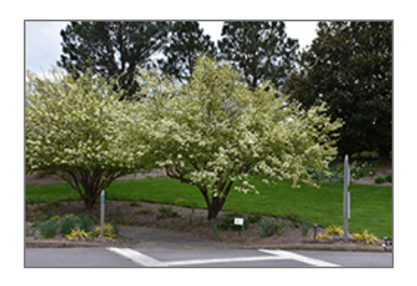
Blackhaw Viburnum in bloom