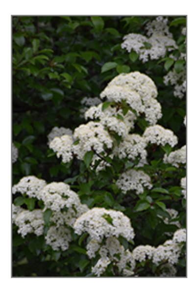
Blackhaw Viburnum flowers

Blackhaw Viburnum is recommended for the following landscape applications;