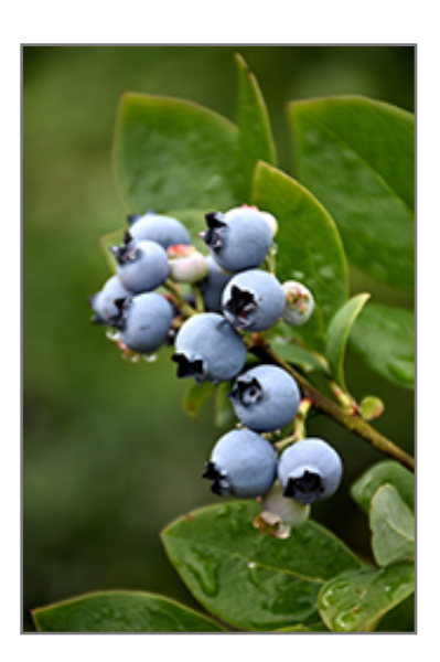
Northblue Blueberry fruit