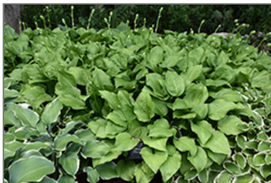
Royal Standard Hosta