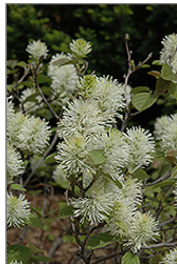
Windy City Fothergilla flowers