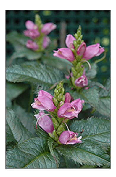
Hot Lips Turtlehead flowers

Hot Lips Turtlehead is recommended for the following landscape applications;