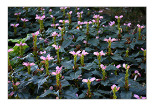
Hot Lips Turtlehead in bloom