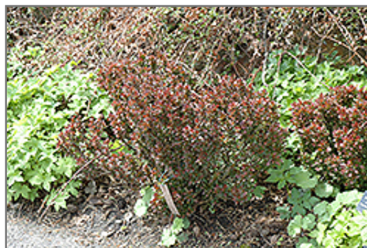
Bagatelle Japanese Barberry