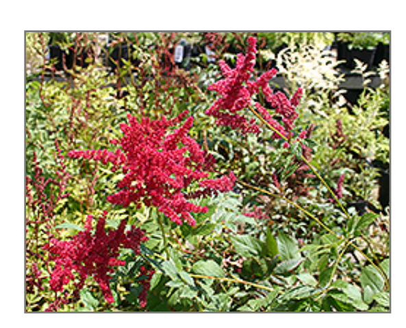
Glow Astilbe flowers

Striking deep rose-red plumes rising above glossy leaves; foliage is bronze-green in spring; perfect in a shady spot with dappled light; prefers moisture so water regularly for abundant flowers and nice foliage