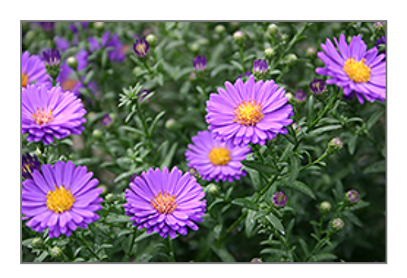
Days Aster flowers

Profusion of dark lavender-blue flowers and attractive lance-like green leaves; prefers cool, moist soil; water the root zone instead of from the top to reduce fungal disease; water regularly to encourage more blooms