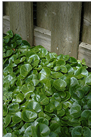
European Wild Ginger