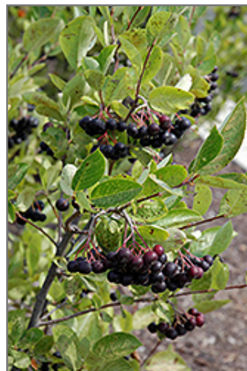
Iroquois Beauty Black Chokeberry fruit