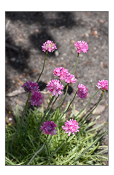
Nifty Thrifty Sea Thrift flowers

Unique tufts of grassy foliage with creamy white variegated foliage; showy globe-shaped pink flowers on wiry stems; this plant thrives in poor soils and xeriscapes