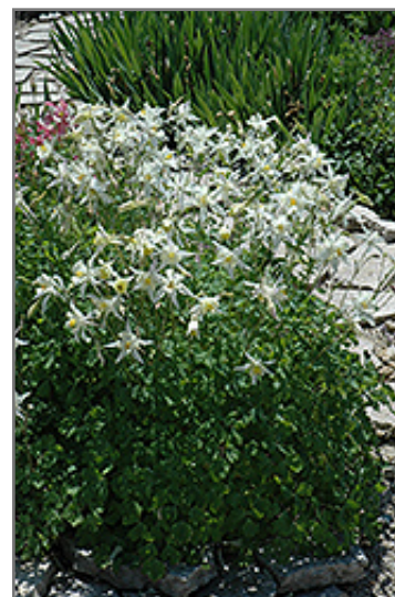
Kristall Columbine in bloom