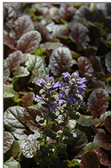
Purple Brocade Bugleweed flowers

Purple Brocade Bugleweed is recommended for the following landscape applications;