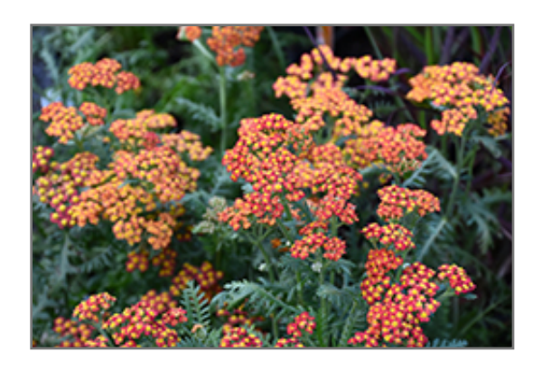
Walther Funcke Yarrow flowers

A very hardy yarrow with long lasting brick-red and yellow plate-like flowers that age to rusty terra-cotta orange; also attractive when used in dried arrangements; tolerates sandy soil and deer