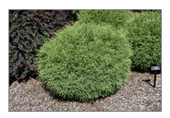
Mr. Bowling Ball Arborvitae

This tiny shrub just demands to be loved by all gardeners, with very unusual threadlike sage-green foliage and an extremely dwarf, compact form that requires no pruning to maintain its perfectly rounded shape; ideal for rock gardens and detail use