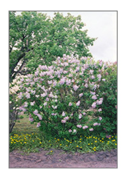
Alice Harding Lilac in bloom