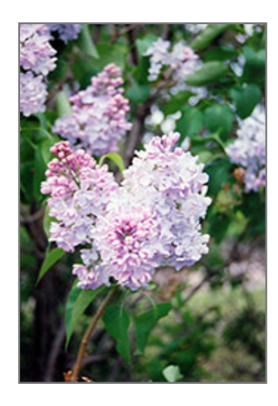
Alice Harding Lilac flowers

Alice Harding Lilac is recommended for the following landscape applications;