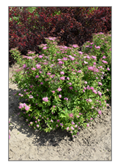
Gumball Spirea in bloom