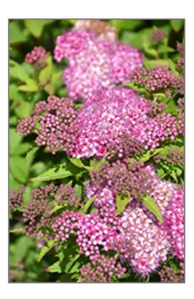
Gumball Spirea flowers