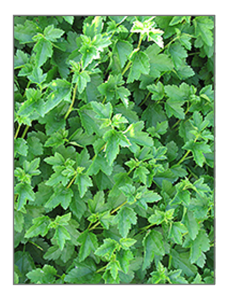
Alpine Currant foliage

This shrub performs well in both full sun and full shade. It is very adaptable to both dry and moist locations, and should do just fine under average home landscape conditions. It is considered to be drought-tolerant, and thus makes an ideal choice for xeriscaping or the moisture-conserving landscape. It is not particular as to soil type or pH. It is highly tolerant of urban pollution and will even thrive in inner city environments. This species is not originally from North America.