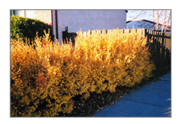
Alpine Currant in fall