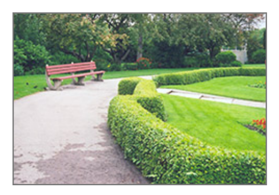
Alpine Currant