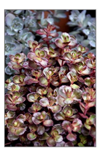
Voodoo Stonecrop foliage