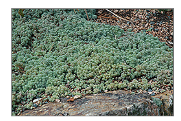
Spanish Stonecrop