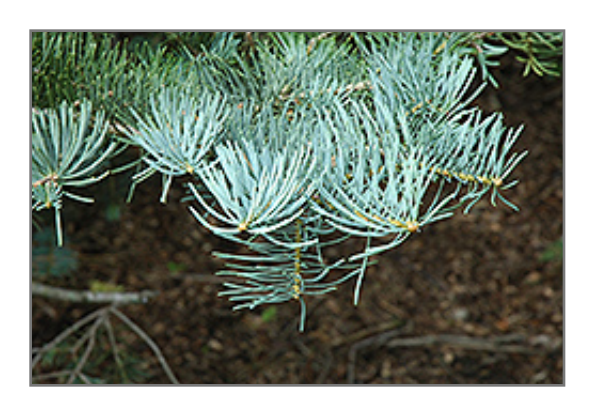
White Fir foliage