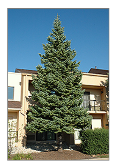
White Fir

This is a relatively low maintenance tree, and usually