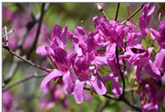
Lilac Lights Azalea flowers