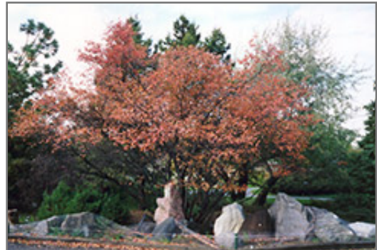
Allegheny Serviceberry in fall

This tree does best in full sun to partial shade. It prefers to grow in average to moist conditions, and shouldn't be allowed to dry out. It is not particular as to soil type or pH. It is somewhat tolerant of urban pollution. This species is native to parts of North America.