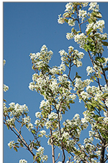
Allegheny Serviceberry flowers