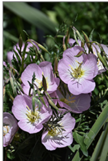
Evening Primrose flowers