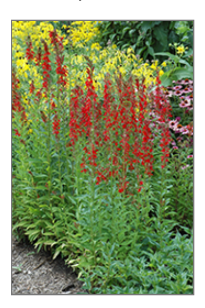
Cardinal Flower in bloom