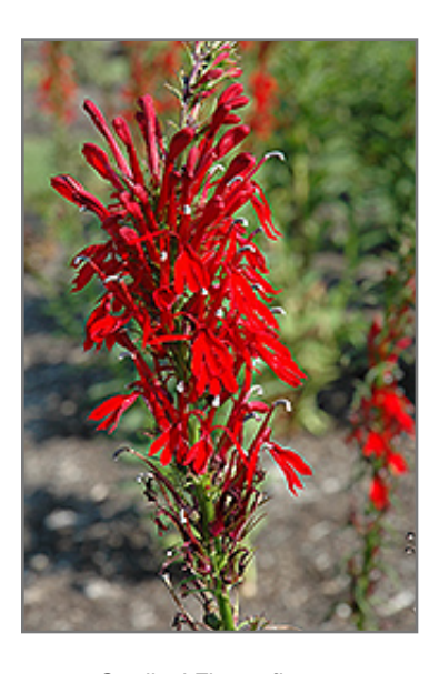
Cardinal Flower flowers