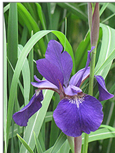
Caesar's Brother Siberian Iris flowers